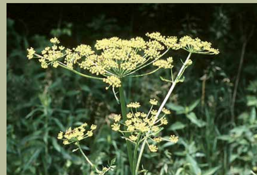
Wild Parsnip ( Pastinaca sativa )

Wild parsnip sap can cause burns when it contacts skin in the presence of sunlight (phytophotodermatitis).