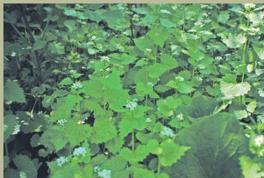
Garlic Mustard ( Alliaria petiolata )

Garlic mustard can quickly crowd out spring wildflowers and tree seedlings.