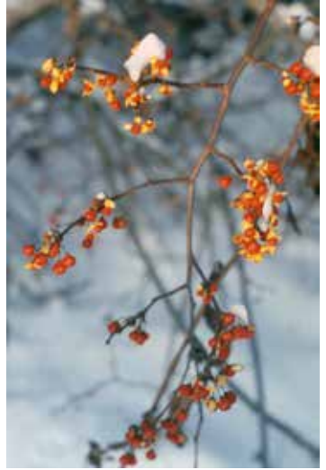
Ellen Jaccuart, TNC

or killed by the vine, which constricts sap flow, weakens limbs and trunks making them more susceptible to wind and ice damage, and shades out leaves growing underneath it. Asian bittersweet is also able to hybridize with American bittersweet, altering the genetic make-up of the species and further reducing rare native populations.