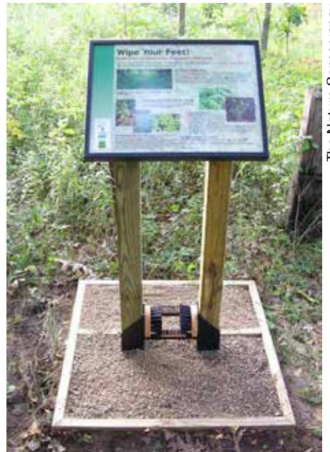
Boot brush station at entrance to nature preserve