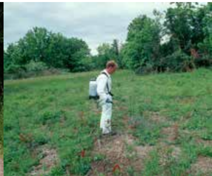
Using herbicide to control invasive plants