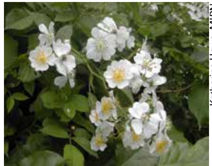
Katherine Howe, MIPN

natural areas. Multiflora rose is tolerant of a wide range of habitat conditions and grows aggressively once established. Multiflora rose can be distinguished from native roses by the presence of fringed stipules (small, green, leaf-like structures at the base of each leaf); stipules on native roses are not fringed.