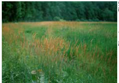
Ellen Jacquart, TNC

FACT: Many non-native species do not cause problems in the areas where they are introduced and can be important for agriculture, horticulture, medicine, or other uses. The species of concern are those that become invasive, taking over native ecosystems and crowding out native species. It is often difficult to know in advance if a new species that is introduced will become invasive, so great caution should be used when importing or planting new species.