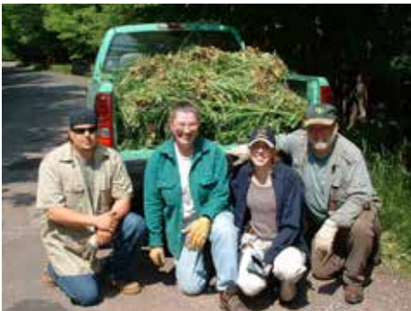
Hand-pulling invasive plants