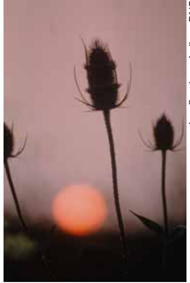
Lee Casebere, Indiana DNR

This species may have been introduced from Europe as early as the 1700's, yet its abundance in the Midwest has increased rapidly in the past 20-30 years. Its range is believed to have expanded along highway corridors, with seeds spread by mowing equipment. Cutleaf teasel is also commonly used in flower arrangements. When these arrangements are discarded or left behind in cemeteries, they can cause new infestations. Once established, cutleaf teasel can expand rapidly into prairies, excluding native vegetation. Teasel has a unique inflorescence that makes it readily identifiable when flowers or seed heads are present.