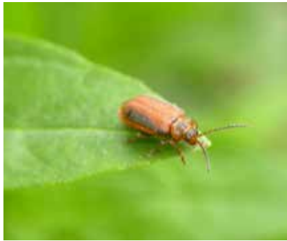
Scott Namestnik, JF New

FACT: There is no one miracle fix for controlling invasive plants. Relying on a single control method is unlikely to be successful. The best approach is an integrated management plan tailored to specific sites and species that includes a combination of methods appropriate to the situation, such as chemical control (herbicides), biological control (insects or pathogens), mechanical control (pulling or cutting), and prescribed burning.