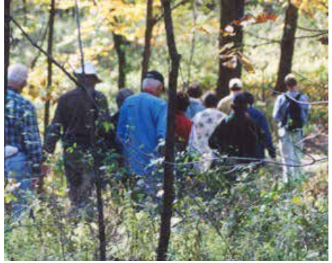
The Nature Conservancy

Invasive plants can affect your ability to enjoy natural areas, parks, and campgrounds. Hikers, cyclists, and horseback riders all enjoy well-maintained trails, and invasive plants can grow over trails to the point that the path cannot be followed or can be difficult to navigate through. Dried and dying knapweed plants catch in bicycle chains, slowing the rider and stirring up dust as they are dragged.