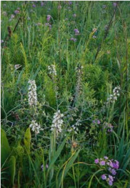
Native prairie plants

Natural scenic beauty sought by recreationalists is degraded by invasive plants, which often form single-species stands, displacing attractive native flowers. The annual trek to see spring wildflowers or hunt for mushrooms may be disappointing when none can be found in a sea of garlic mustard.