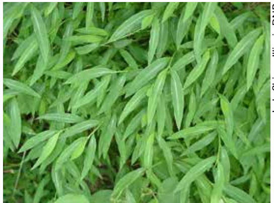
Jody Shimp, Illinois DNR

Japanese stiltgrass is an annual grass that thrives in forested areas with moist soils and along streambanks and ditches. It often makes its way into forests along trails or old logging roads and from there can rapidly spread into the forest understory, completely wiping out all other plants within just a few years. Stiltgrass has broad leaf blades that can be identified by the presence of a pale, silvery stripe of hairs along the middle of the leaf on the upper leaf surface. Japanese stiltgrass is abundant in the southern part of the Midwest region and is rapidly moving northward.