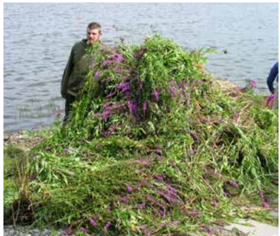
Purple loosestrife plants